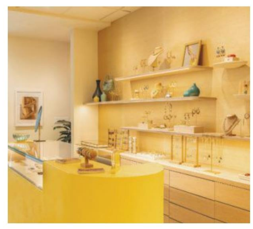
25 modern luxury

RIDE Brightline (gobrightline.com), America's modern and sustainable intercity rail, is back in service in South Florida. Relaunching its Miami, Fort Lauderdale and West Palm Beach stations, the ride service is back and better than ever with some topnotch service enhancements and investments. From an elevated sit-down bar serving all-day breakfast, lunch and dinner to an innovative autonomous market where riders can now pick up snacks and other conveniences almost effortlessly, Brightline is pulling out all the stops for its Floridian return. Not to mention the transportation service also unveiled its new door-to-door service, Brightline+, powered by the Brightline app and supported by a fleet of Brightline-branded vehicles. o